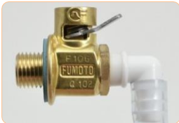
F-Hose attached to L-001 & F106S

The F-Hose drain hose fits FN, FS and FSW series valves with 3/8" nipples. 3' length allows a user to easily direct the oil flow into a receptacle. Especially useful when the drain port location is obstructed or in a difficult to reach area.