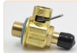
F-Cap shown on F106N

The vinyl corrosion resistant F & M Caps slip over the nipple end preventing unwanted material from collecting inside the nipple while under use.