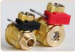
LC-10, LC-15 shown in locked position

LC-10 & LC-15 Lever Clips attach to the valve stem and lock the actuating lever in the closed position. Choose if you desire extra security over and above what the standard locking lever mechanism offers.