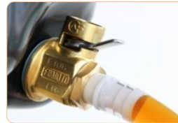
SH-10 attached to F106S & F-Hose

The SH-10 Socket is used to securely attach a 3/8" hose to S and SW series valves. Use with the optional F-Hose to direct the oil flow into a receptacle when the drain port location is obstructed or in a difficult to reach area.