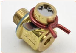
HC-58 shown on F-106

HC Hose Clips firmly secure the lever in the locked position for extra safety and security. If you operate your vehicle on rough terrain or in conditions where objects may strike the oil drain port location (i.e. logging, off-road, farming) we recommend installing a hose clip.